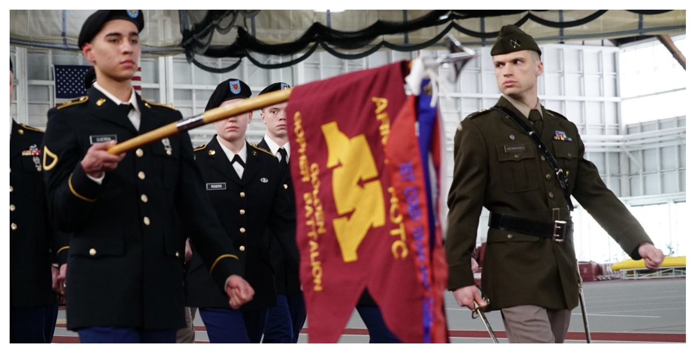
Golden Gopher Cadets executing the pass and review during Annual Joint Service Review