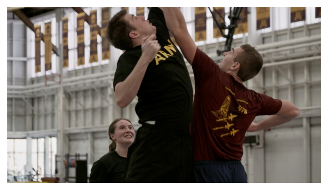
Cadets competing during the Joint Military Athletic Competition