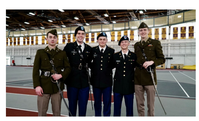
Senior Cadets during the Annual Joint Service Review