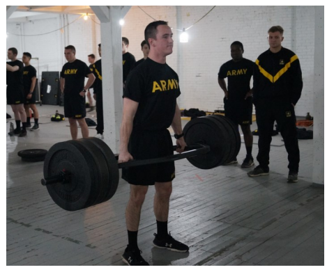
Cadet during the new Combat Fitness Test (ACFT)

Army Training Site for MSIs and MSIIs to get familiar with rucking and MSIIIs to prepare them for Advanced Camp. We conducted one official ACFT this semester. Everyone performed phenomenally with the new PT system in place and achieved great results.