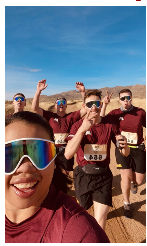
Bataan Marathon team at White Sands Missile Range, NM