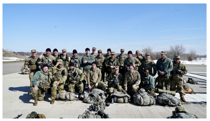
Cadets at Arden Hills Training Site during a Mega Lead Lab