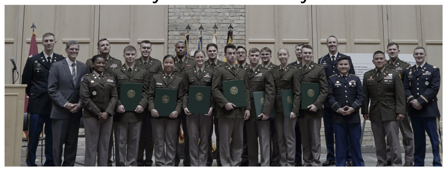
Golden Gopher Battalion Commissioning - Spring 2023