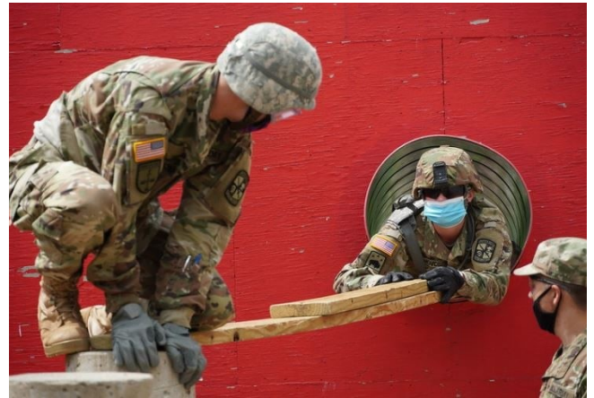
OAL Cadets working a Field Leader Reaction Course obstacle