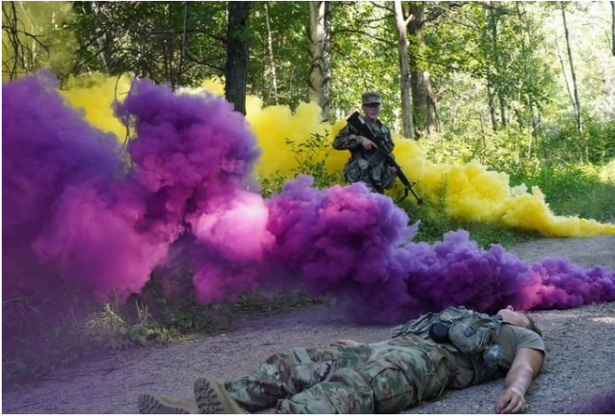
OAL Cadets conducting actions on the objective during Squad STX