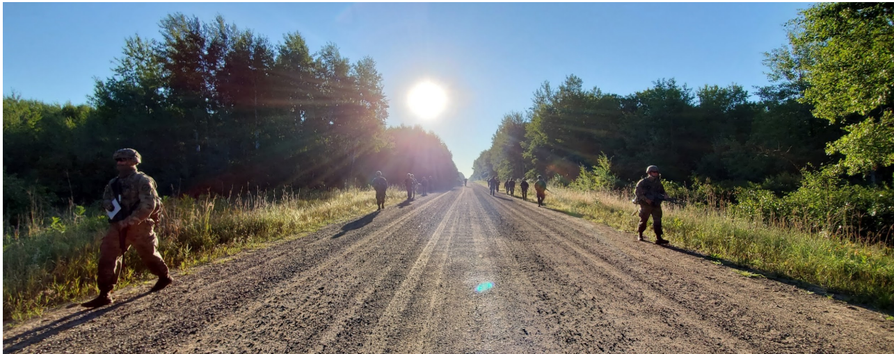
Gopher Battalion Cadets conduct OAL training at Camp Ripley, Minnesota - August 2020