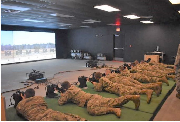
DBC Cadets at the Camp Ripley Engagement Skills Training facility