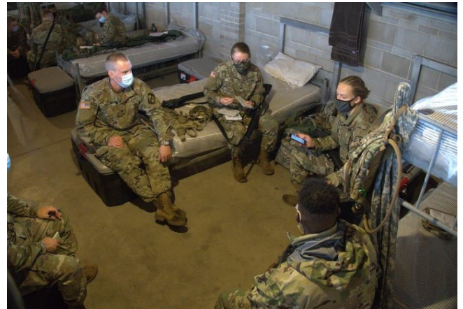
OAL Cadets during Garrison Operations at Camp Ripley training facility