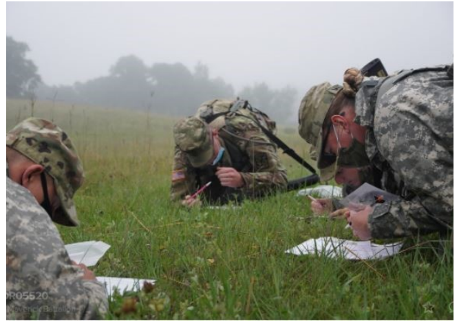
OAL Cadets verifying their points during the Land Navigation Course