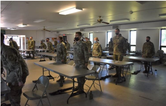
Distributed Basic Camp Cadets during classroom instructions at Camp Ripley