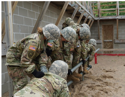
Basic Camp (DBC) Cadets during the Field Leader Reaction

social distancing and masks. This did not affect the training at all other than you were a little farther away from the other Cadets and Cadre and wearing a mask. One thing I took away from this amazing experience at Camp Ripley was the amount of resources a young Cadet or Officer has access to. These great resources are the many Army manuals, like the Ranger Handbook, other commissioned officers and the many NCO's that are available to give advice and answer any questions you might have. Honestly, this experience and the many others I will have in the future is why I decided to join and continue with the Army ROTC program at the University of Minnesota.